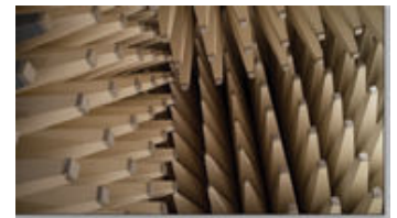
From single test benches up to complex multi-antenna test systems, multiple configurations are available to adapt to your needs.