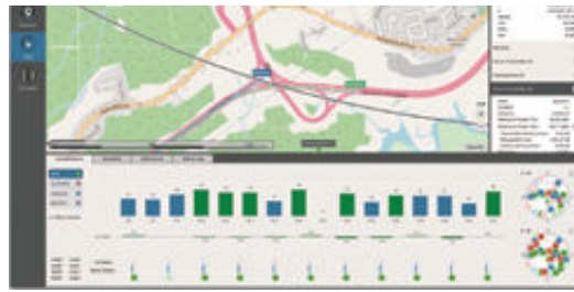
Some of its many innovations include a user-friendly interface, powerful and documented API, and intuitive automation tools.