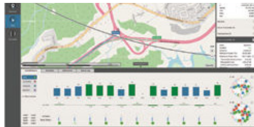
Some of its many innovations include a user-friendly interface, powerful and documented API, and intuitive automation tools.