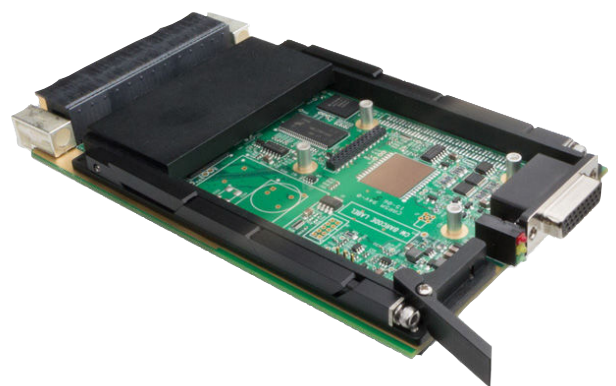
Some models are conduction-cooled ready with a thermal frame option

Orolia TSync boards offer a high degree of ruggedness, customization and field upgradability. If a new application or change in deployment requires a different feature set, we can usually accommodate it.