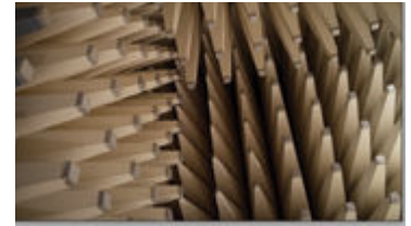
From single test benches up to complex multi-antenna test systems, multiple configurations are available to adapt to your needs.