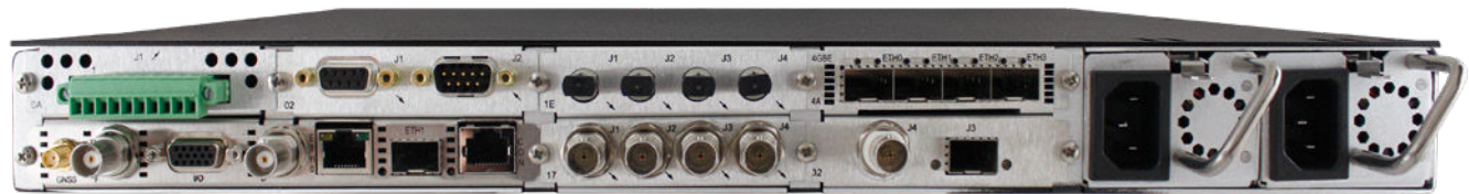
SecureSync 2400 Add the features you need through options modules, up to 6 option modules per unit and 2 Hot Swap power supplies slots.