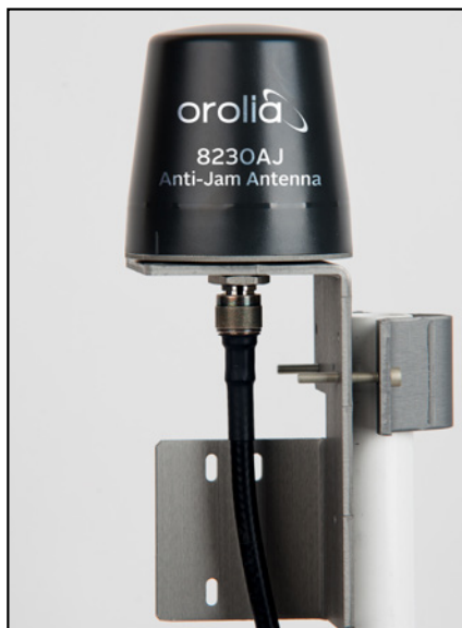
Model 8230AJ GPS/GNSS Anti Jam Outdoor Antenna with optional PVC Pipe (Model 8235) and optional Rugged Post Mount (Model ANT-KT)