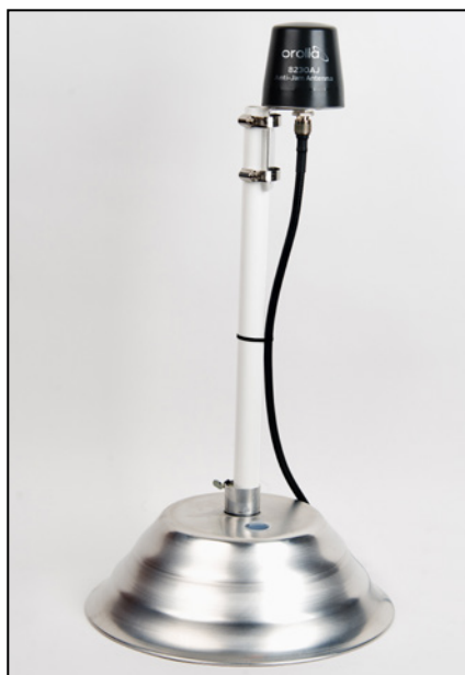
Model 8230AJ GPS/GNSS Anti Jam Outdoor Antenna with optional PVC Pipe (Model 8235) and optional Flat Roof Mount (Model 8213)